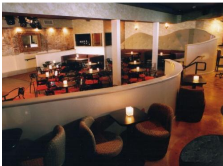
Open area seating in The Grotto

The Grotto , or back theater area is equipped with a 50 sq. ft. stage, two sets of turntables night club and stage lighting and full audio capabilities for all types of live and DJ spun music. This area can be reserved privately as well as is used for open seating. Capacity of The Grotto is 175.