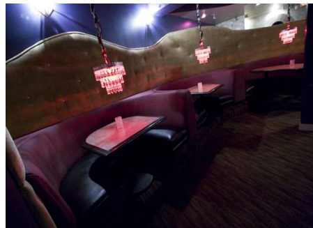
VIP Section of The Grotto